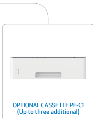
OPTIONAL CASSETTE PF-C1 (Up to three additional)