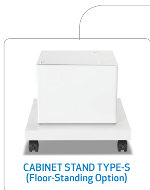
CABINET STAND TYPE-S (Floor-Standing Option)

Extended Service Packs Canon eCarePAK Canon Extended Service Plans offer coverage beyond the standard one-year limited warranty 7 up to four years.