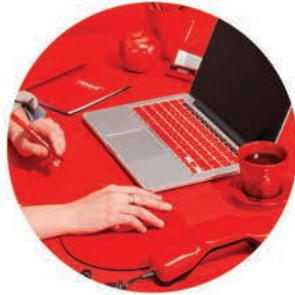
MANAGED IT SOLUTIONS