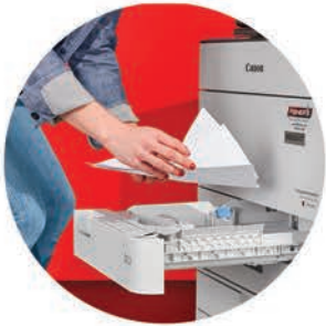
COPIERS + PRINTERS