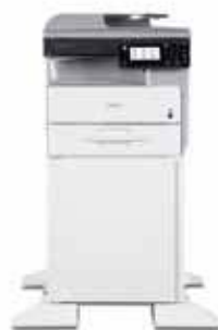
MP 301SPF and FAC 57 Cabinet

Some features may require additional options.