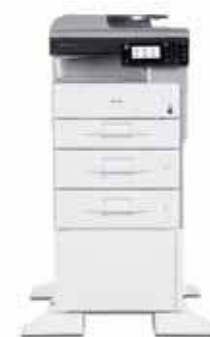
MP 301SPF with Two Optional PB1040 Paper Trays and FAC 58 Cabinet