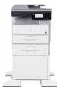
MP 301SPF with Optional PB1040 Paper Tray and FAC 58 Cabinet